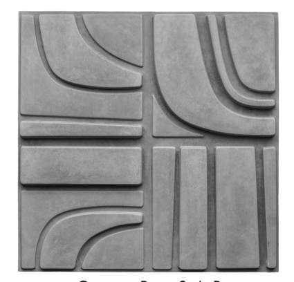
Concrete Brute Style B