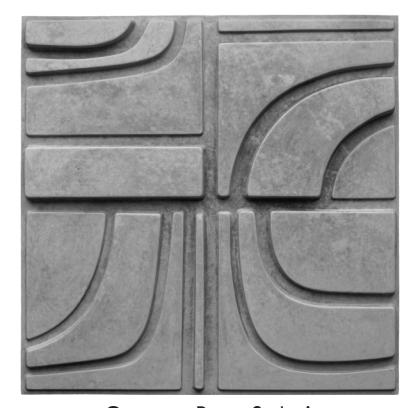
Concrete Brute Style A